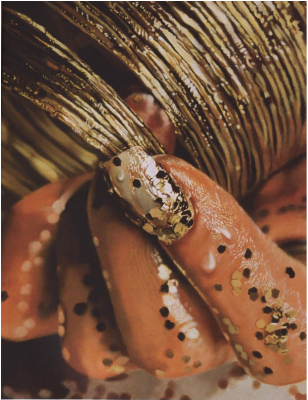
Goldfingers (2002): Enamel on metal, 30x24 in.