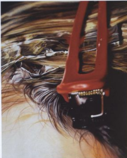
Clip (2005): Enamel on metal, 30x24 in.