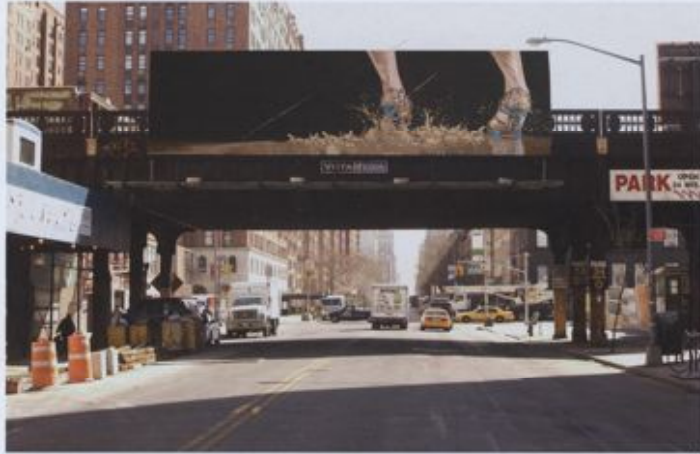
Shitkicker: (23rd Street) 10th Ave on the High-line.