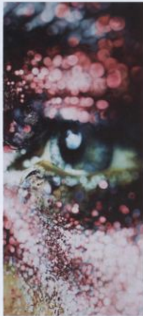
Glazed (2006): Enamel on metal, 96x60 in.