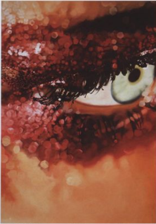
LAtoNY (2003): Enamel on metal, 72x48 in.