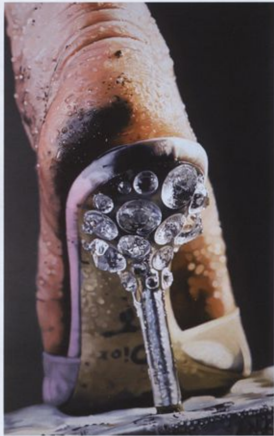
Strut (2005): Enamel on metal, 96x60 in.