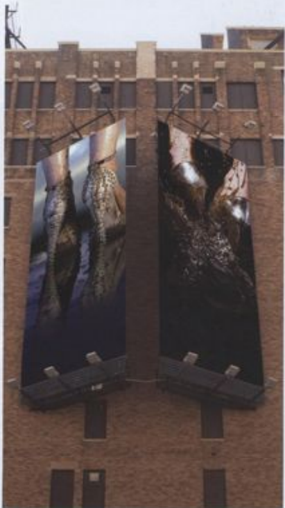
Splish Splash and Runs: installations view, (23rd Street) New York, 10th and 11th