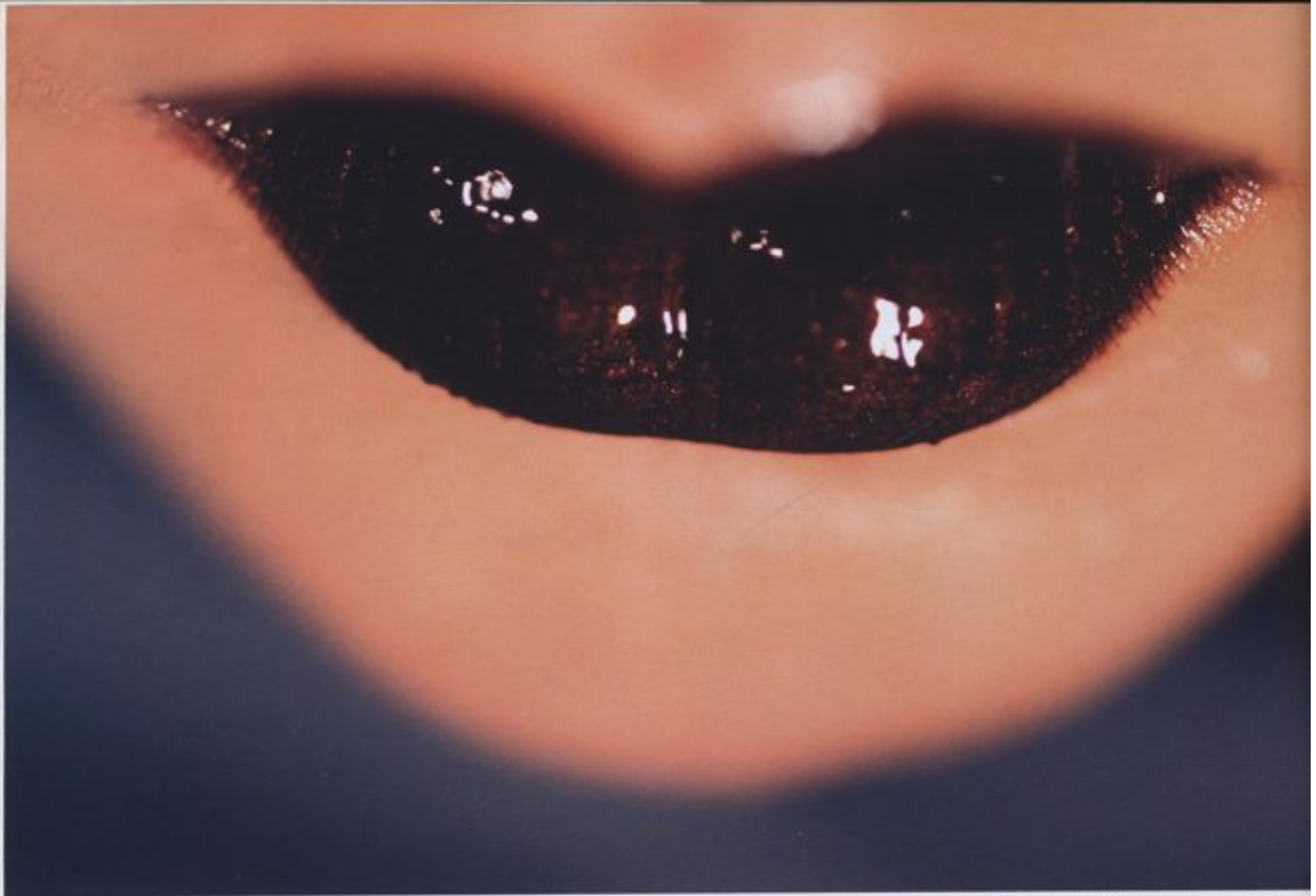
Black Cherry (2002): C-print, 36x50 in.