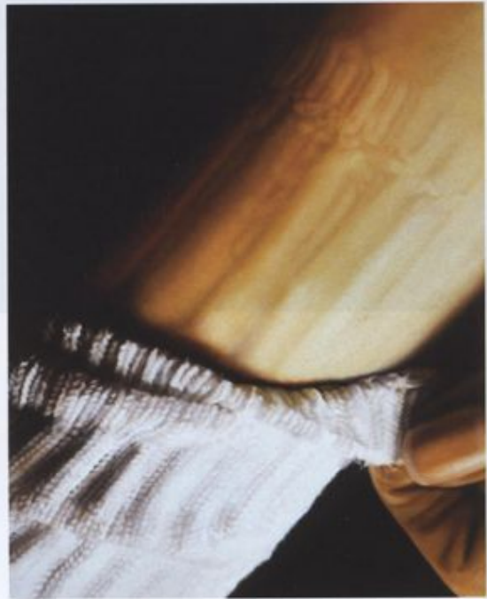
Sock (2005): Enamel on metal, 30x24 in.