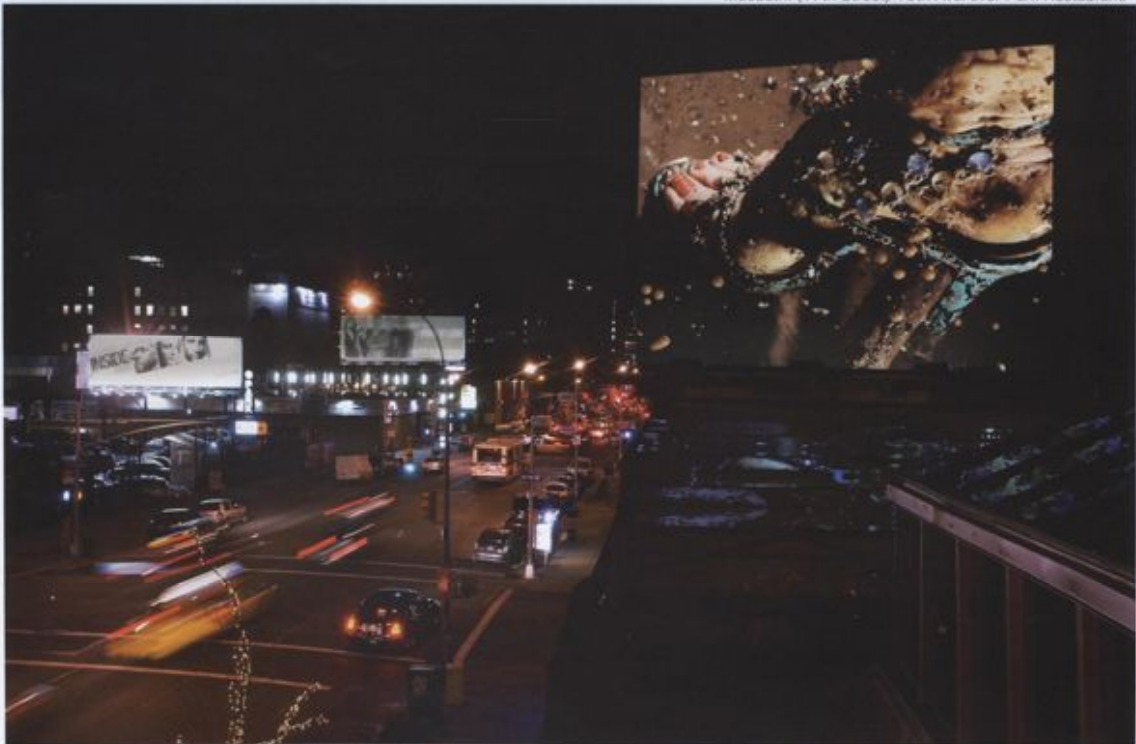
Mudbath: (17th Street) 10th Ave. over Park Restaurant.